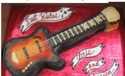
Electric Guitar - Add cake to the neck of the Wilton guitar pan to increase the length and correct the proportions. Airbrush body.