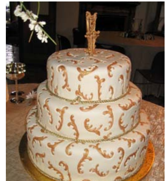
Golden Scrolls - Scroll embossed fondant is placed on the cake and then painted with gold luster dust.