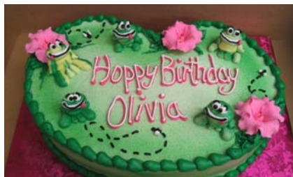
Hoppy Birthday - Figure piped frogs on a green lily pad with bright hibiscus flowers.