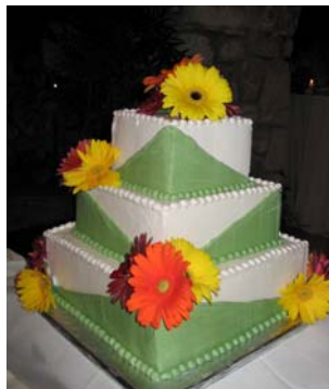
Two-Toned Wedding Cake - white and sage green with bright gerbera daisy accent flowers.