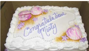
Elegant Seaside Engagement - marbled candy seashells with a ring inside!