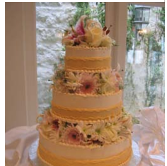
Spring Wedding - white buttercream icing, peach buttercream bordered icing band and loads of beautiful spring flowers!