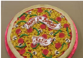
Pizza Cake? - fondant pepperoni, green peppers, mushrooms and cheese.