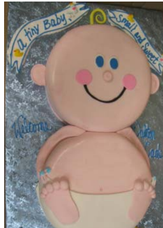
A tiny baby small and sweet will come to make your life complete... Round cakes covered in flesh colored fondant with a white diaper and molded fondant details.