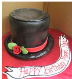
Top Hat Magician - fondant covered with fondant brim and red band with a red rose.